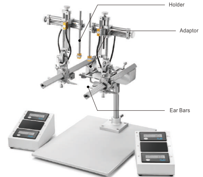
Large Animal Stereotaxic Instrument

A complete set of configurations consists of a large animal stereotaxic instrument, an adaptor (page 13), ear bars (page 14), holder (page 13). A single manipulator model can add the right manipulator to become a dual manipulator model.