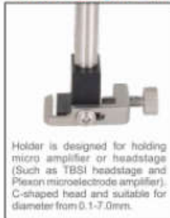
68106 Headstage Holder

Holder is designed for holding micro amplifier or headstage (Such as TBSI headstage and Plexon microelectrode amplifier). C-shaped head and suitable for diameter from 0.1-7.0mm.