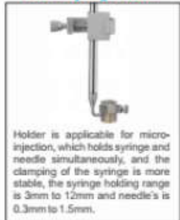
68218 Syringe Holder

Holder is applicable for micro-injection, which holds syringe and needle simultaneously, and the clamping of the syringe is more stable, the syringe holding range is 3mm to 12mm and needle's is 0.3mm to 1.5mm.