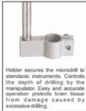
68605 Microdrill Holder

Holder secures the microdrill to stereotaxic instruments. Controls the depth of drilling by the manipulator. Easy and accurate operation protects brain tissue from damage caused by excessive drilling.