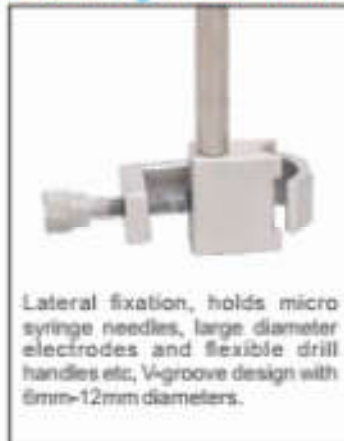
68202 Large Probe Holder

Lateral fixation, holds micro syringe needles, large diameter electrodes and flexible drill handles etc, V-groove design with 6mm-12mm diameters.