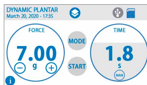
USB key to export csv data to PC