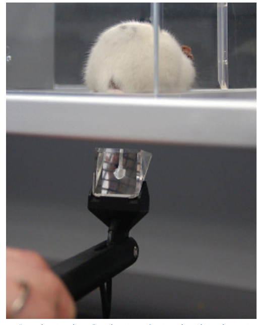
Fig. 1: "touch stimulator" with prism. Optional grid mesh not included

The metal tip used in the e-VF is the same as the one used in the classic Ugo Basile Dynamic Plantar Aesthesiometer 37450, allowing consistent comparison of results among the two instruments.